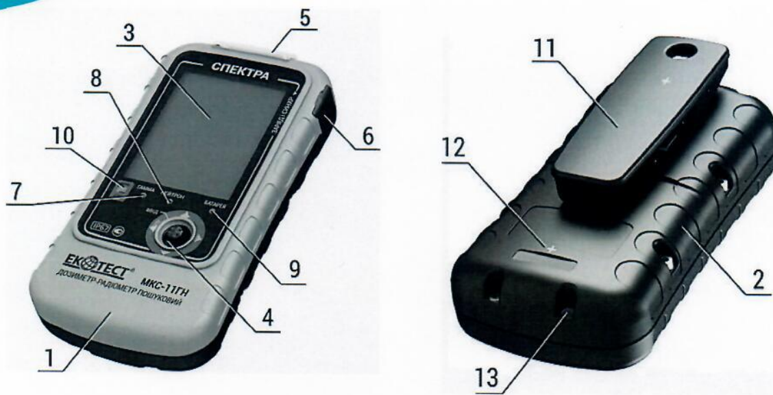
Figure 1 – Appearance of the device